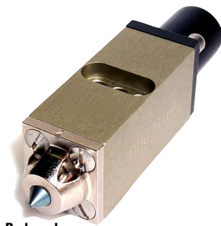
Reduced Cavity Replacement