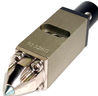
Zero Cavity Replacement